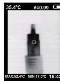
White & black