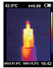
Iron oxide red