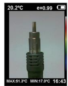
Visible light camera